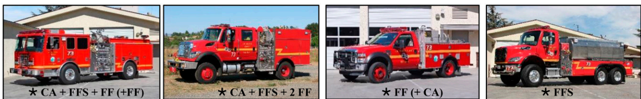
Figure 1. LACoFD Rolling Equipment

Notes. From left to right are type I, III, and VI engine variants and a water tender. Each type I structural engine is staffed with a CA, an FFS, and one or two FFs. Each type III off-road vehicle carries a CA, an FFS, and two FFs. Each type VI off-road patrol engine carries an FF and perhaps a CA. Each water tender is driven by an FFS.