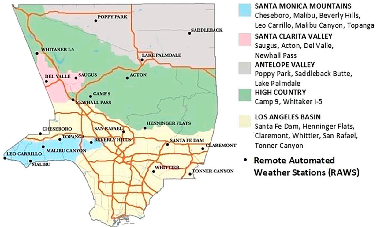
Figure 2. Five Los Angeles County Climatic Zones

Notes. Each zone has relatively homogeneous climate, terrain, vegetation, and population density. Black dots locate most of the 21 RAWSs, named here. Santa Clarita, Santa Catalina Island, and San Clemente Island are not pictured.