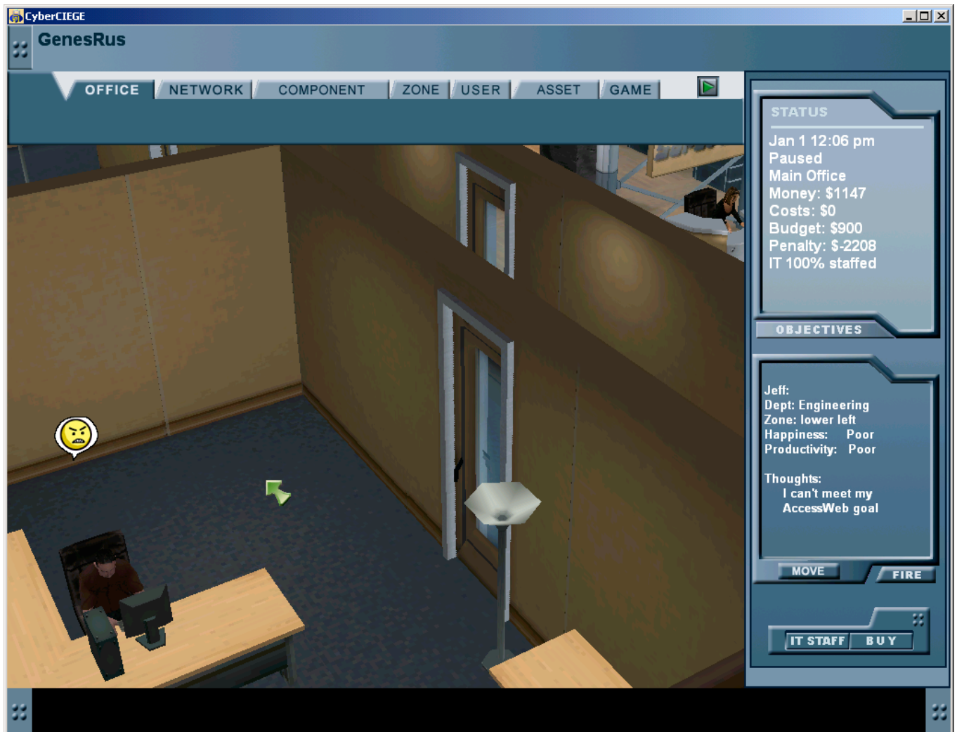
Figure 1: CyberCIEGE user at work