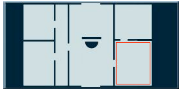
Figure 2: Office floor plan highlighting a zone

Conditions and Triggers: The scenario designer defines conditions to be assessed by the engine during play, and