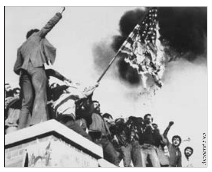
U.S. Embassy in Tehran, November 9, 1979

Additionally, declarations of war reinforce and contribute to a less politically divisible America. The United States is either at war or it isn't, as Congress determines. With declarations of war there are no legalistic sleights of hand or half measures that can be used politically to promote domestic disputes over foreign policy. Here it is important to think beyond just the domestic price we pay for such disputes. Clever foreign enemies will always try to take advantage of our political divisions, which is all the more reason to use declarations to signal, both to Americans and to foreign audiences, the seriousness and unity behind U.S. intent.