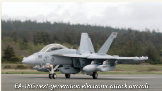
EA-18G next-generation electronic attack aircraft