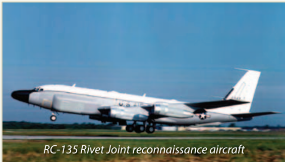
RC-135 Rivet Joint reconnaissance aircraft