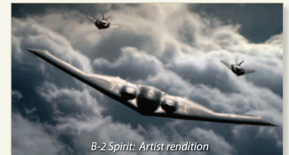
B-2 Spirit: Artist rendition