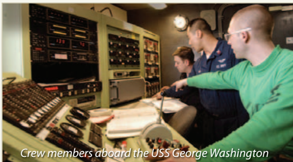
Crew members aboard the USS George Washington

A two quarter capstone project provides an opportunity for students to work within a group to complete an assigned EW project and then deliver an oral presentation and written report. The intent is to develop effective oral and written communication skills. The capstone project is optional and included in the curriculum only if desired by the customer.