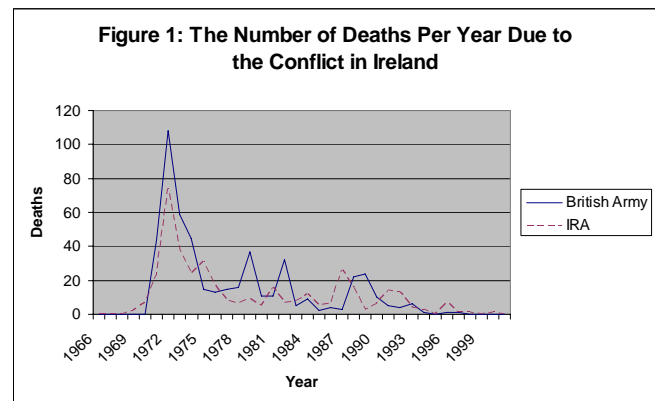
Fig. 1 The Number of Deaths per Year Due to the Conflict in Ireland

b/d describes the efficiency of predation, converting a unit of prey into a unit of predator [16].